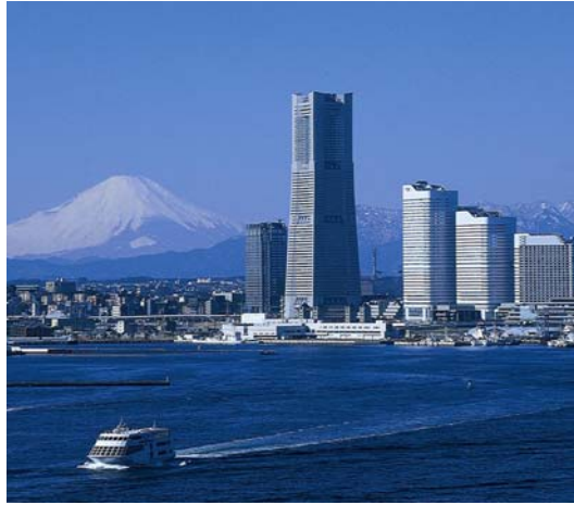
The venue of the conference